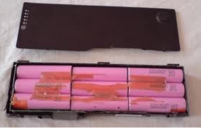
Inside a lap top battery