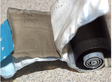
Inside a lithium metal cell